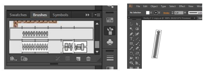
Fig. 3: Use of Brushes to create clothing zipper

Also, using brushes we created zipper detail.