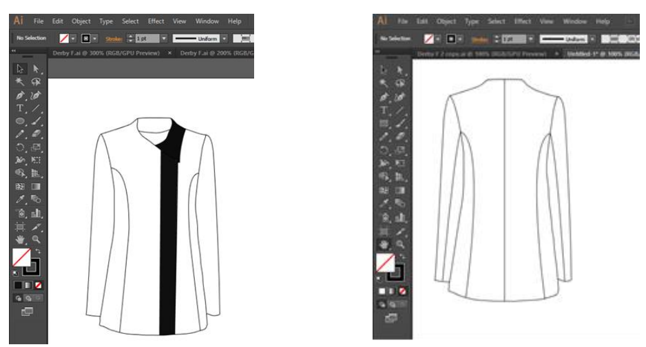
Fig.1: The jacket model created in Adobe Illustrator

We started by making the model of the jacket using the instruments of Adobe Illustrator programme.