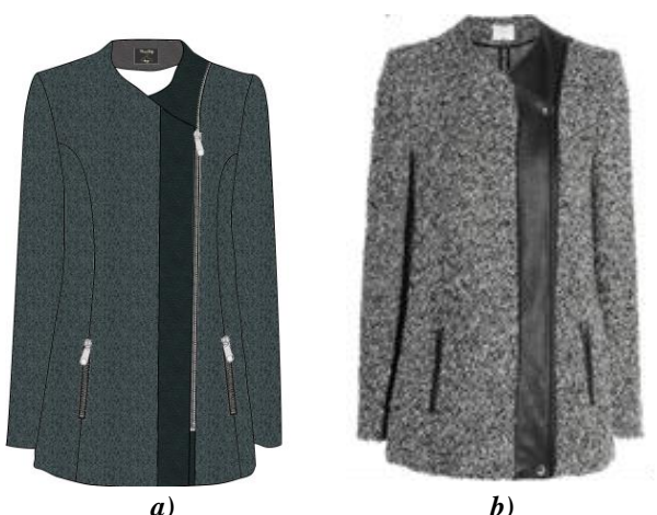
Fig. 5: The Woman jacket image a) Done in Ghimp; b) Manufactured